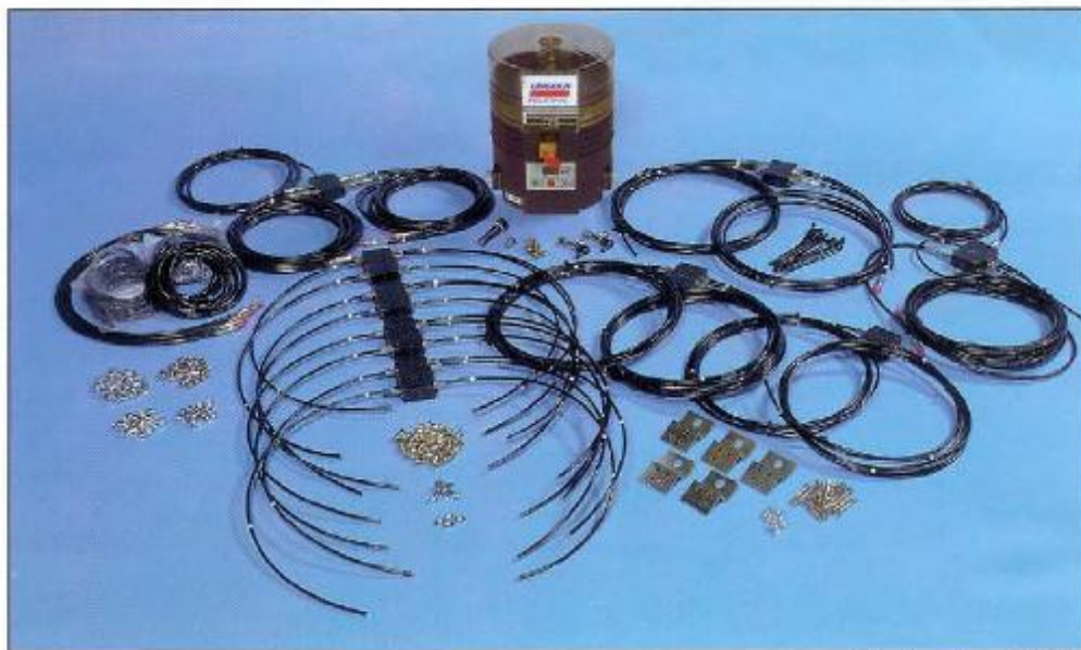
Part number B96372